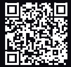
RUTM09 360° VIEW

The RUTM10 is a wired router featuring four Gigabit RJ45 ports and Wi-Fi 5 connectivity options, making it ideal for applications that require both wired connections and a wireless access option for Internet access. The RUTM10 can establish a Wi-Fi mesh network within your networking solutions, enabling a smoother and more robust wireless network experience while making it highly secure due to the router's support of VPNs like OpenVPN, IPsec, Wireguard, and Tailscale.