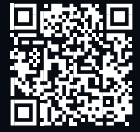
RUT361 360° VIEW

The RUT361 is a robust cellular router with speeds of up to 300 Mbps with carrier aggregation, vital for IoT solutions demanding uninterrupted networks in challenging environments. Remote monitoring, advanced security features, and WAN failover make this LTE Cat 6 router feature-rich, and two Wi-Fi antennas ensure greater device applicability in diverse M2M applications.